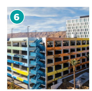
1700 PAVILION GARAGE MURAL by Bonnie Kelso Downtown Summerlin