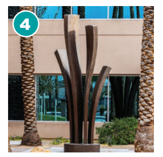
UNITY by Archie Held Business Park once owned by HHC, located across the street from Trails Village Center