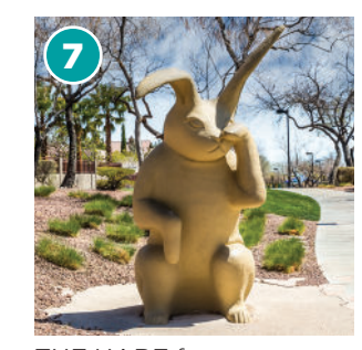
THE HARE from AESOP'S FABES: THE TORTOISE AND THE HARE The Willows Park