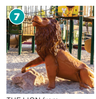
THE LION from AESOP'S FABES: THE LION AND THE MOUSE The Willows Park