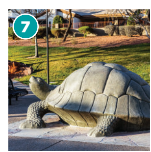
THE TORTOISE from AESOP'S FABES: THE TORTOISE AND THE HARE The Willows Park