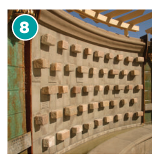
WARSAW GHETTO MEMORIAL Temple Beth Sholom